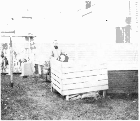
Warren can side-step the garbage until the end of the month when he covers the field with it.