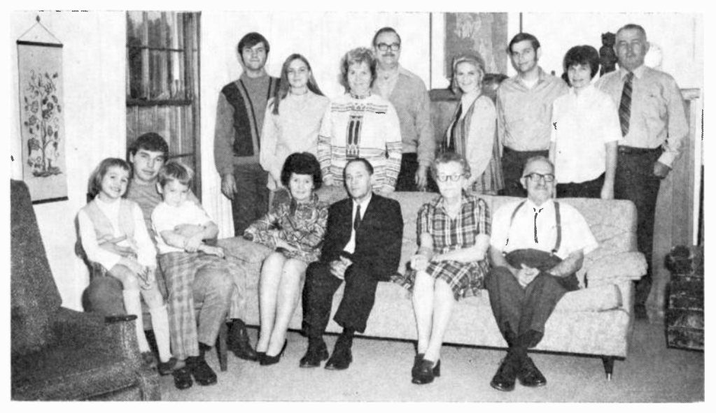
The KMA Guide

Incidenta:ly, there is still time to ask for your copy of the 1971 spring catalog if you have the remotest idea that your name might not be on the mailing list. Give us your zip code too.