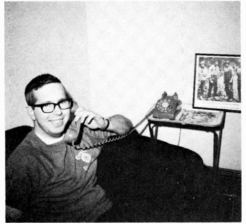
The picture on the wall shows the charter members of the Warren Swain fan club.