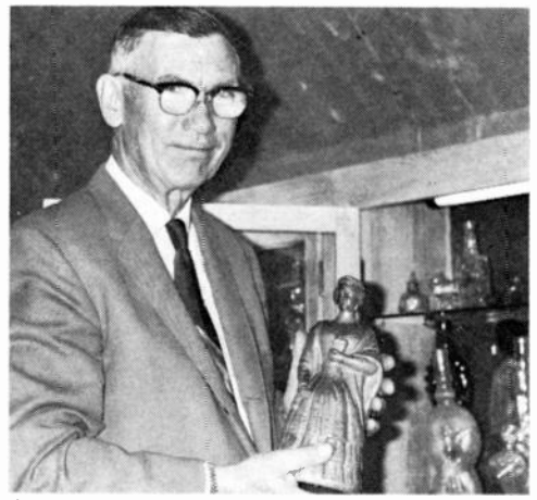
Joan of Arc is an opaque French decanter.