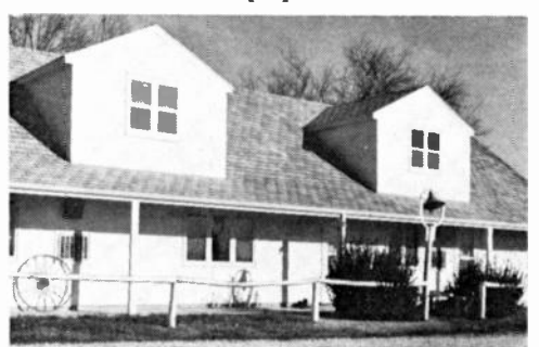
The House of a Thousand Bottles.