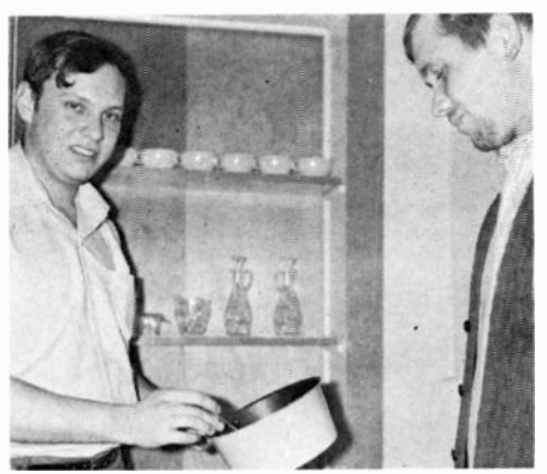
"The Galloping Gourmet" strikes again, much to roommate Gary's dismay.