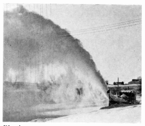
Blowing snow many feet in the air, the snow plow worked overtime on local highways.