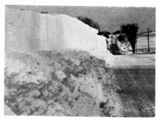
One of the most startling drifts blocked Highway 2 east of Shenandoah. It looked like this after the plows were able to cut through.