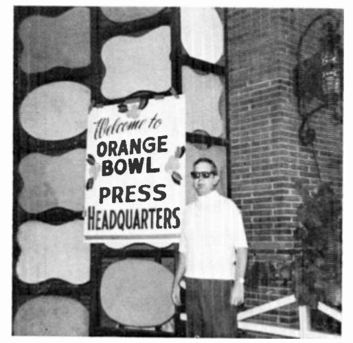
Upon my arrival in Miami, Fla., I took a moment to have my picture snapped in front of the Orange Bowl Press Headquarters.