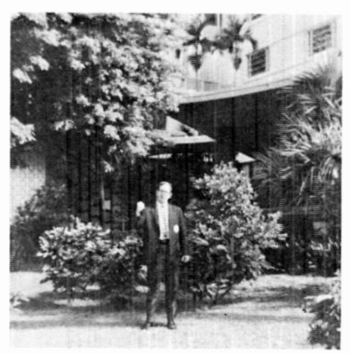
I was right in the swing of things, wearing my official "Go Big Red" aftire for the Orange Bowl.