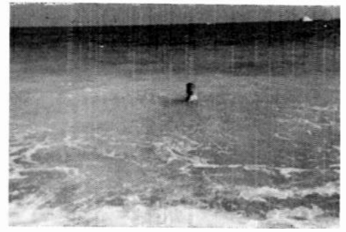
Being in Miami Beach, I could not pass up several opportunities to swim in the ocean.