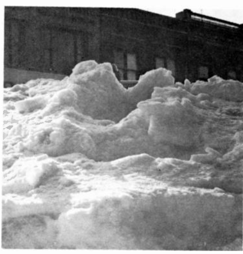
Although slightly distorted, this view of a downtown Shenandoah street is the impression most people had of the depth of this, the worst snow in a decade,