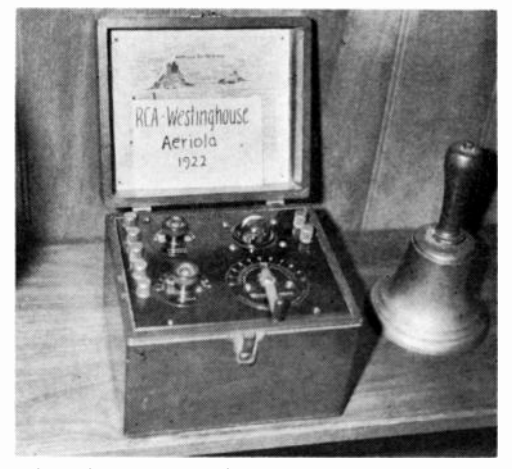
The oldest radio in the collection is the RCA-Westinghouse Aeriola built in 1922. As are many of the sets, it was battery operated and the listener heard the programs through earphones or the old-fashioned horn type loudspeaker.