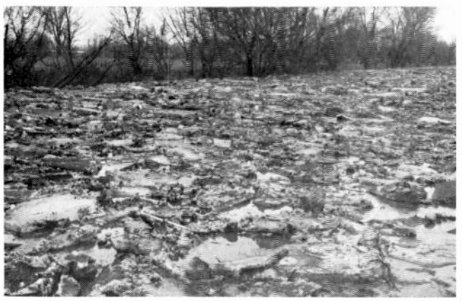
Choked and overflowing with ice was the description for most of the small rivers in this area lately. Chief Don Burrichter took this picture of the Nishnabotna River near Shenandoah.