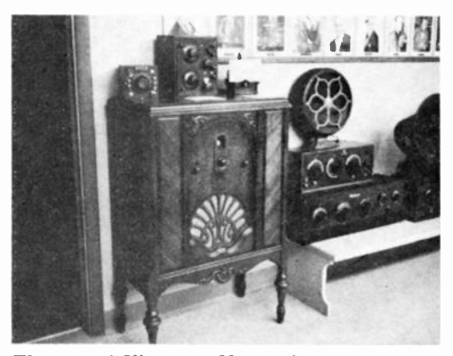
The Freed-Eismann Neutrodyne was made in 1923 and featured 5 tubes and 3 tuned circuits. It sold for $150. Almost hidden by its white name tag is the Crosley Pup, the portable predecessor to the popular transistor. It used one tube, headphones and sold for $10.

The top row of "tubes" made up the Inductance (Atwater Kent) Tuned Model of the early 1920s. It is sitting on the Stromberg Carlson Neutrodyne Receiver.