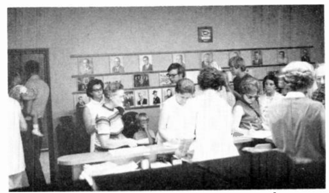
KMA Radio front office a tracts crowd. August, 1971

U. S. flag continues as favorite of huge throng.