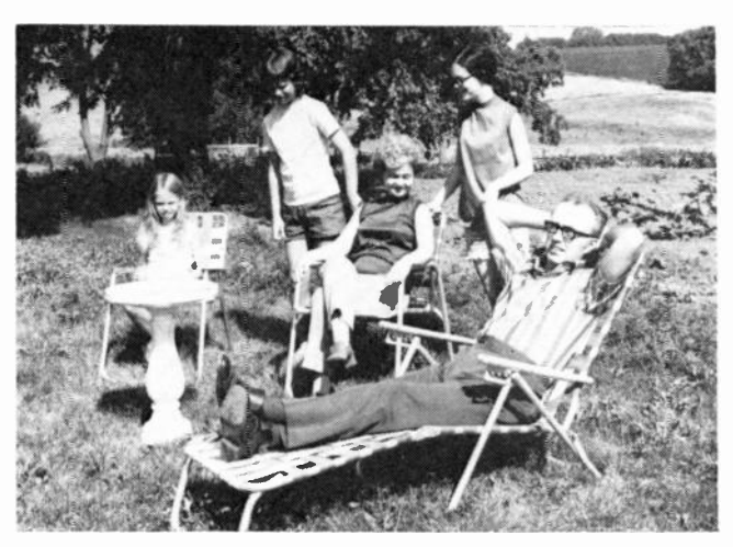
The KMA Guide