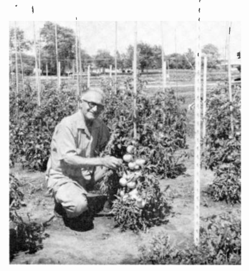
The KMA Guide

Up until this year my favorite Tomato has been Surprise, with Tom Boy running a close second. It is too early in the season yet to say definitely, but I honestly believe that the new variety called Red Heart is going to outdo both Surprise and Avalanche, if such a thing is possible. It, too, like all of the other Missouri introductions, is what is called "uniform ripening" which means exactly that. They never have the dark green shoulders and the cracks that were so common with the older Tomato varieties. The next time you are in Shenandoah take a little extra time and go out to the Tomato plot in the trial grounds and check up on these varieties that I have been talking about and see for yourself how much superior they are to the older varieties.