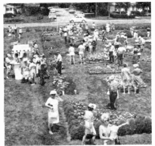
Part of crowd around booth and flower beds.