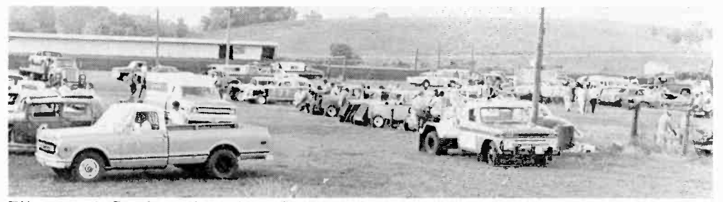
Pit area at Corning where two classes of cars, small coupes and super stock cars, race every Saturday under the auspices of Mid Track Racing and the Adams Fair Board.

Adams County Speedway at Corning and filled in at the Shelby County Speedway at Harlan.