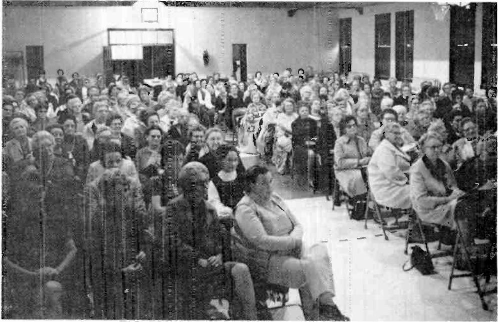
Crowd of women relaxed and enjoying entertainment by Shenandoah Singers of the Shenandoah High School and a fashion show produced by merchants in Shenandoah.