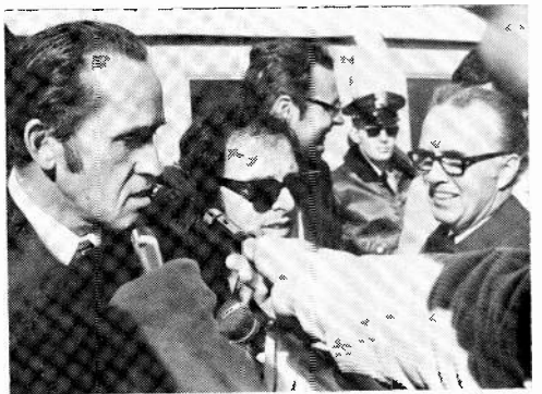
For pictures of the Yugoslavians visit to Iowa turn the page.

The November crop report was released just before I finished this article. It shows an even greater yield than previous reports, placing the production of corn and other grains at record proportions. It has given rise to concern that unless controlled it could result in greater feeding of livestock eventually affecting and lowering their prices. It will be interesting in the days ahead to see how the new Secretary of Agriculture handles this problem.