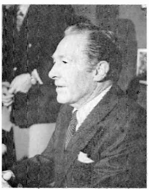
Mayor Sam Yorty