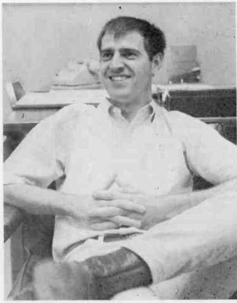
"Do I like Girls Basketball? Of course I do. I also like girls."