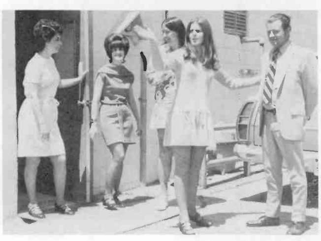
The KMA Guide