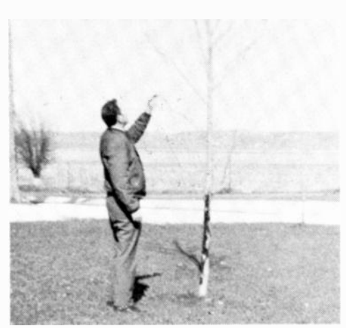
"I hope people don't think that I'm toughskinned. I'm just a human being like everyone else. Each official is like each player, an individual."