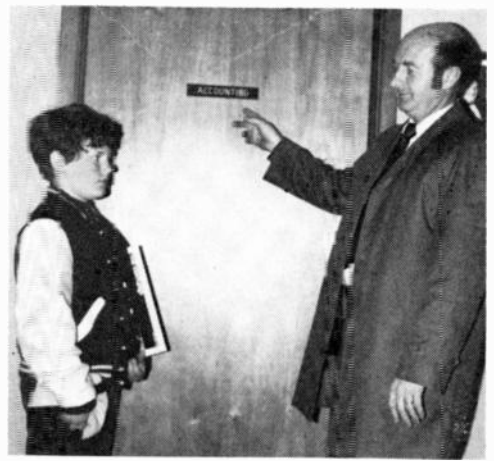
Father points out office sign to son.