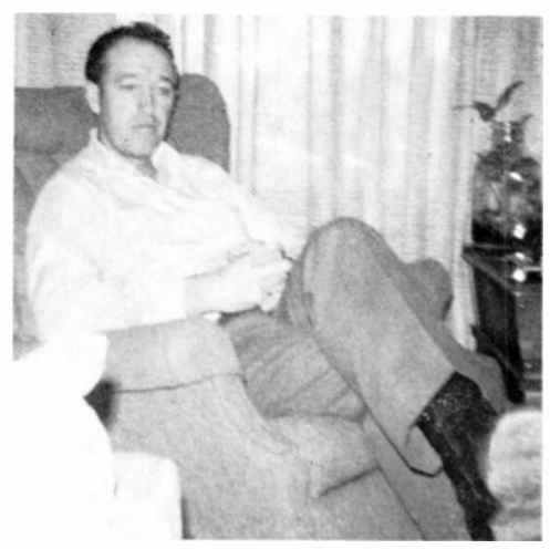
"I am very partial to basketball, I have played it all my life and just have a great admiration for the game."