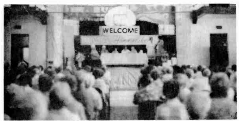
Scene at armory August 15.