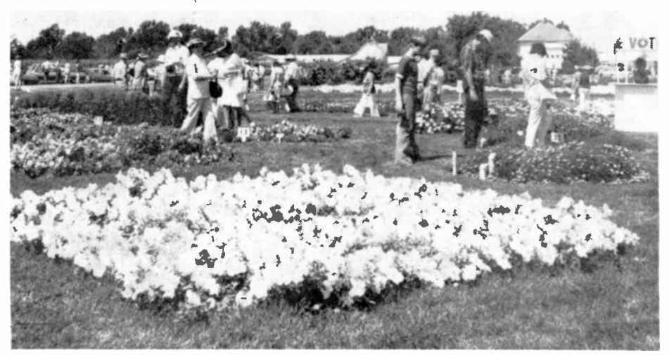
Thousands of visitors came for the 18th annual Open House at the Earl May Test Gardens held July 20.