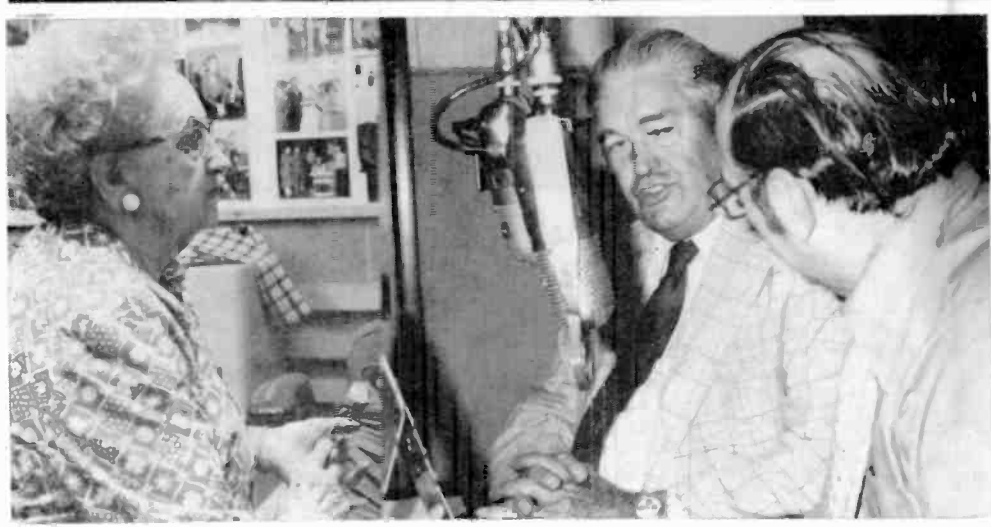
The KMA Guide