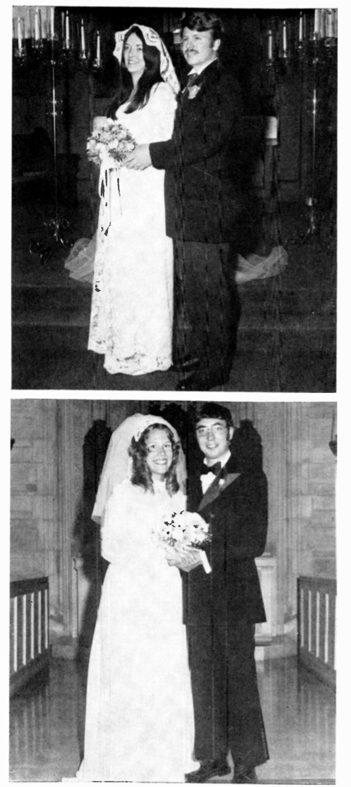
The KMA Guide