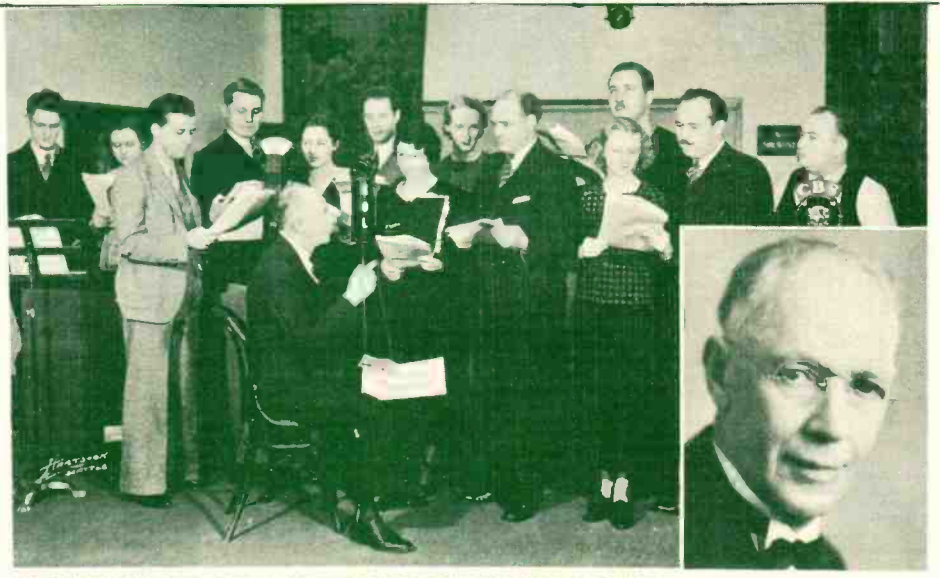
DIRECTOR, CAST and PRODUCTION STAFF IN ACTION FOR "PIONEERS," POPULAR SUNDAY PROGRAM.