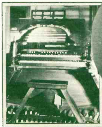
KOL'S MIGHTY ORGAN Showing master console in organ room and "baby" console in studio