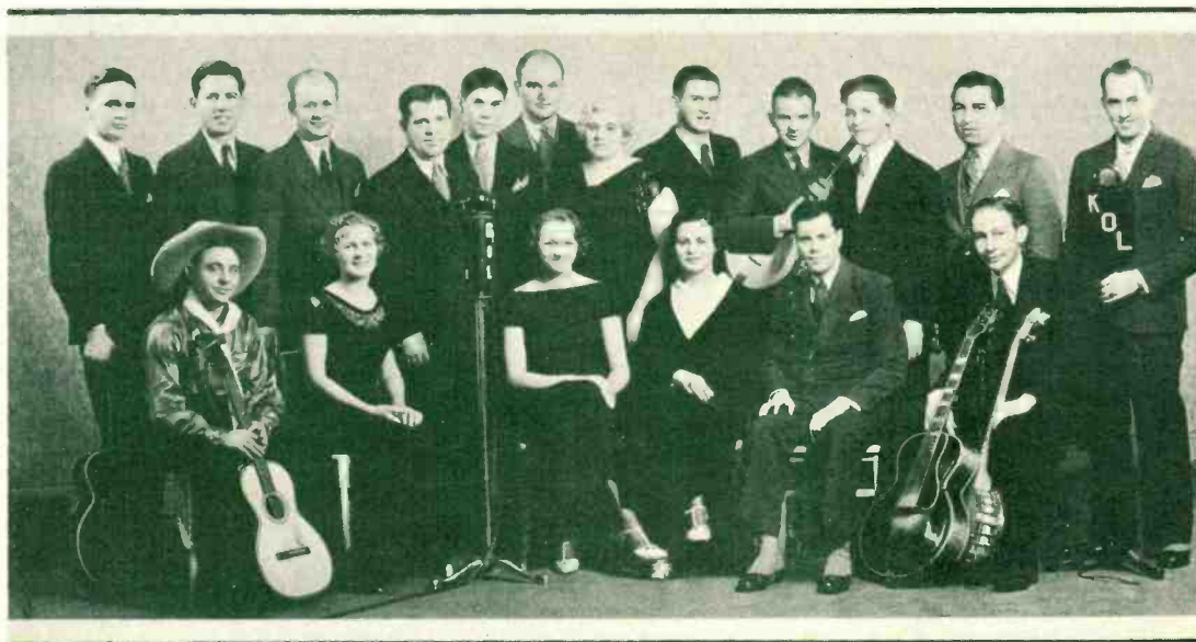
NOON HOURS RING WITH CHEERY LAUGHTER AND BRIGHT MELODIES BECAUSE OF THESE ARTISTS OF KOL'S CARNIVAL HOUR

HOLIDAY AND TRANSMITTER DEDICATION SOUVENIR EDITION