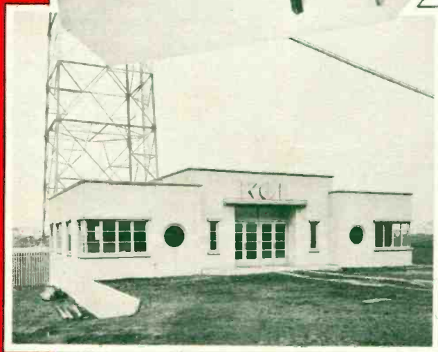
(Left) KOL's new antenna towering above Seattle.