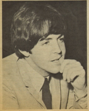
The Worrier . . . What's Bothering Him?