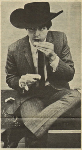
"Looking for Somebody, Stranger?"