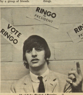
"And If I'm Elected, I Pr