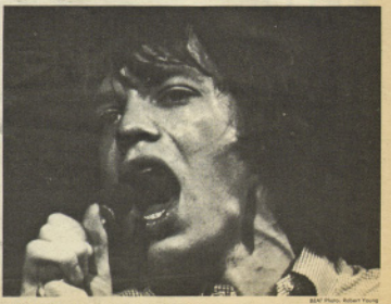
THE JAGGER wails as only he can do, shaking up every female in the audience with his on-stage performance. It's wild — it swings and Mick admits that it's "suggestive."