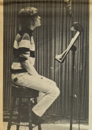
HERMAN (of the HERMITS) gets ready for cue to pre-record one of the songs he delivers in the film. Because of technical requirements, what you see on the screen in the finished movie is actually HERMAN "mouthing" to his own voice, recorded before they film him singing it.

But the action in the film comes from the guest stars, headlined by England's HERMITS. The pictures to the right tell the story.