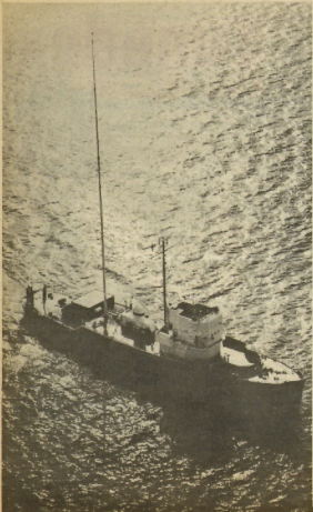
RADIO LONDON, a former U.S. minesweeper, broadcasts from outside England's three mile limit as a commercial radio station.