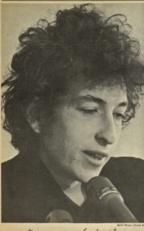
"love minus zero/no limit"