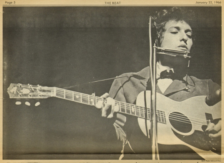
"the times they are a changing