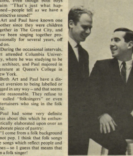
... SIMON AND GARFUNKEL

thing is a good, healthy sign, and both boys agreed with me when I suggested that folk music seems to become "folk" music primarily in retrospect. Paul added