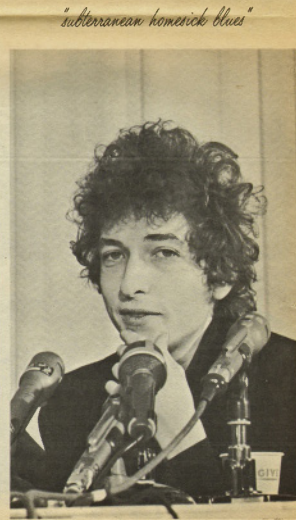
JAI Photo: Ouck Boyd