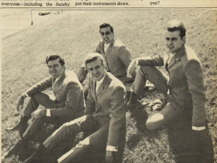
... THE STATLER BROTHERS

put them in national prominence. Looks like the Statler Brothers no longer have time for counting flowers on the wall or playing solitaire 'til dawn.