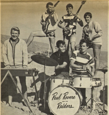
PAUL REVERE AND HIS RAIDERS are pictured here with Dick Clark minus the rest of the "Action" gang The trouble with this on location filming is quite simple and most obvious - it's cold on the beach! But the show must go on and so the Raiders bravely play their instruments despite rain, sleet, etc.

folk singers but folk entertainers. Alright-would you believe three great entertainers singing some folk songs just about as well as they're gonna get sung?!!