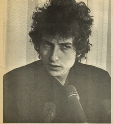
"only a pawn in their game"