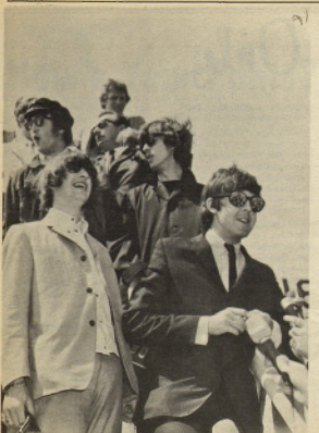
THE BEATLES were unable to attend our Pop Awards Banquet, as you all know. They were kind enough to send us a telegram explaining that they were on their British tour at that time. But this morning the postman delivered a real surprise to us-actual proof of where the Beatles were on December 8. They were getting off the plane in Sheffield, England, So The BEAT forgives them