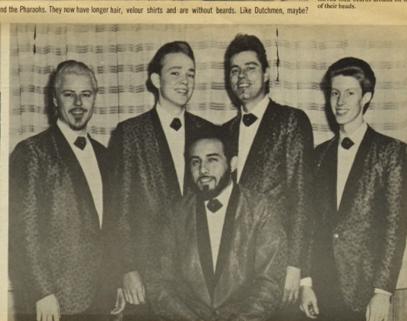
THE ORIGINAL "image" of Sam the Sham and the Pharaohs when they favored bright jackets and ties. They looked older then, didn't they?