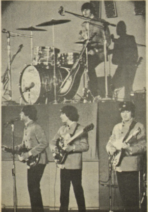
BEATLES - SENT WIRE THANKING BEAT, FANS FOR THREE AWARDS