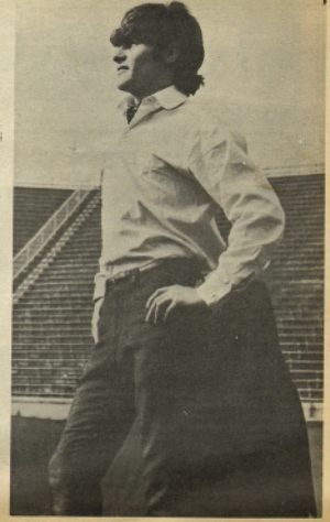
PETE BEST stands solemnly contemplating what will happen now that

in the meantime, Fete has released "Boys." Yes, the same "Boys" which the Beatles recentty released as a single and as hurriedly withdrew from the market. Rather interesting, isn't it?