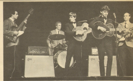
THE EVERLY BROTHERS, sporting new-style haircuts, were a holiday hit at Dave Hull's Hullabaloo.

.Zip 6290 Sunset, Suite 504 Hollywood, Calif. 90028