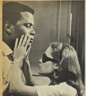
A TENDER MOMENT as the bind girl explores the face of her new fined. Explosive stagenes is bill in the story as the girls mother, a streetwalker, soon learns of her friendship with the nam. Palling on punches, the fine nother hates all Regress, and she takes not seen as the stageness of the friendship with the nam. Palling she takes not seen as the stageness of the stageness of the stageness and she takes not seen as the stageness of the stageness of the stageness of the stageness of the stageness of the stageness of the stageness of the hater of an estimation of the stageness of the stageness of the stageness of the stageness of the stageness of the stageness of the stageness of the stageness of the stageness of the stageness of the stageness of the stageness of the stageness of the stageness of the stageness of the stageness of the stageness of the stageness of the stageness of the stageness of the stageness of the stageness of the stageness of the stageness of the stageness of the stageness of the stageness of the stageness of the stageness of the stageness of the stageness of the stageness of the stageness of the stageness of the stageness of the stageness of the stageness of the stageness of the stageness of the stageness of the stageness of the stageness of the stageness of the stageness of the stageness of the stageness of the stageness of the stageness of the stageness of the stageness of the stageness of the stageness of the stageness of the stageness of the stageness of the stageness of the stageness of the stageness of the stageness of the stageness of the stageness of the stageness of the stageness of the stageness of the stageness of the stageness of the stageness of the stageness of the stageness of the stageness of the stageness of the stageness of the stageness of the stageness of the stageness of the stageness of the stageness of the stageness of the stageness of the stageness of the stageness of the stageness of the stageness of the stageness of the stageness of the stageness of the stageness

story each of us should learn very carefully. It's not all "drama," either. The funny moments come often, and PATCH will be one of 1966's most entertaining films.