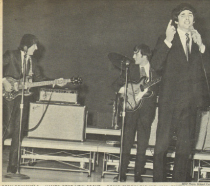
BEAU BRUMMELS - NAMED BEST NEW GROUP - DOING BYRDS' BIG HIT, "MR. TAMBOURINE MAN