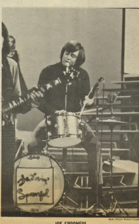
... JOE SPOONFUL

He was gone then, suddenly, but at least we had been treated to a small taste of The Lovin' Spoonful