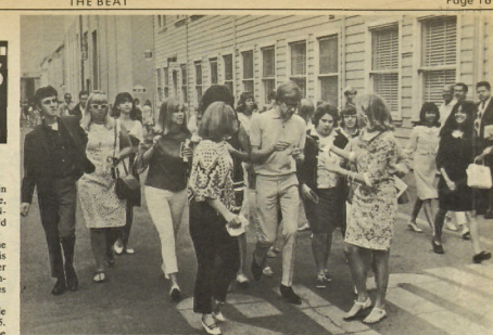
TERNAGES, MOSITY GIRLS, nob one of HERMAYS HERMITS as he starts for the gate at MGN. The Gulver City studio was the scene of mass piginimages by screaming fairs when word leaked out that the HERMITS were working on a film there. The studio had to add extra police guards to hold back the enthusiastic crowks. By the way, the front of the MGN studio is seen in the movie — doubling for fronkey College in the story of a rich playboy who goes out West to get eway from a certain young lady denser friend.