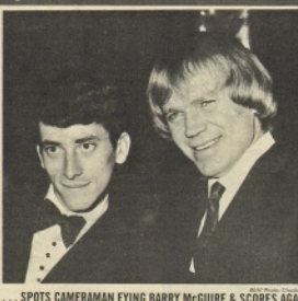
ACGUIRE & SCORES AGAIN