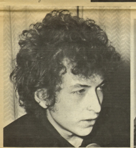
"it's alright ma, i'm only bleeding"