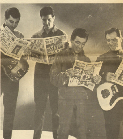
THE FOUR SEASONS, in Hollywood for a series of TV appearances, catch up on what's happening.