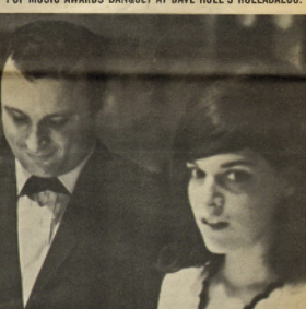
NINO TEMPO AND EVIE SANDS JOIN AUTOGRAPH LINE AT DOOR