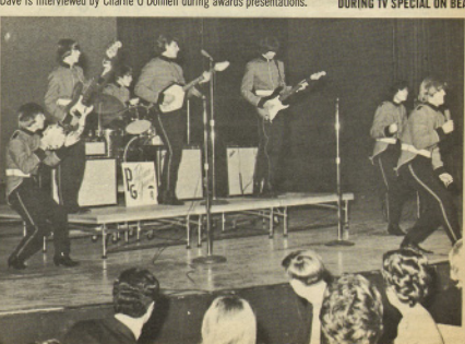
THE PALACE GUARD, REGULARS AT THE HULLABALOO, LIVEN THINGS UP DURING AWARDS SHOW. HER