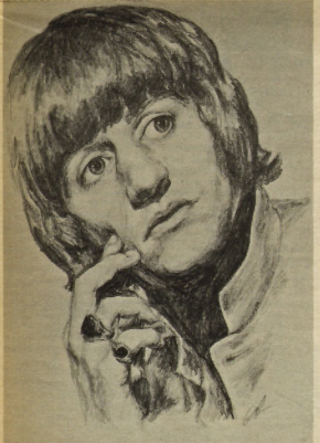
... RINGO CAPTURED IN A PENSIVE MOOD