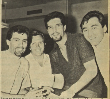
FOUR SEASONS (1 to 1) Frankie Valli, Tommy deVitto, Bob Gaudin and Joe lang smile as they hare the good news. Their "The 4 Seasons Gold Vaulf of Hist" has been certified for a Gold Record, signifying sales of one million dellars for the LP. This makes the second 4 Seasons' Goldie for allow alsale; their first being for their "Rag Dolf" athum, On the singless scene, the Seasons' unique version of the Gole Porter oldie, "The Golf You Under Wy Skin", its anshing up the nation's charts — but them the 4 Seasons seldom miss!