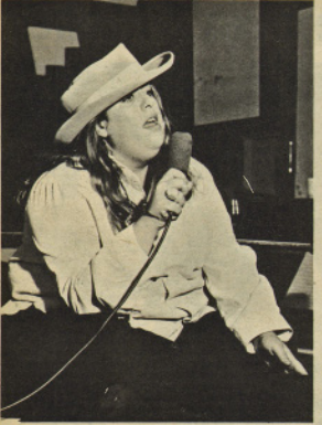
MAMA CASS - A large bird who met a Beatle.