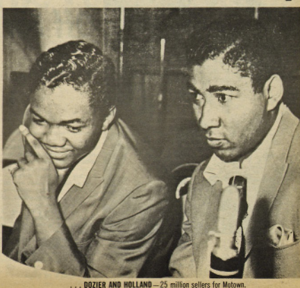
But Motown doesn't stand still The three of them are generally the Miracles is one of the ton

We knew it would be big." notes Brian, "but we didn't know