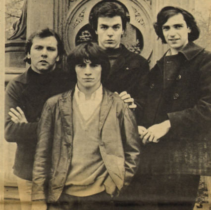
. . . THE YOUNG RASCALS (I. to r. Gene, Eddie, Dino and Felix) have discovered the secret.

Outwardly, he is somewhat of a comedian who is always there with the quick ad-lib, the funny line. But inside the smile there is a very