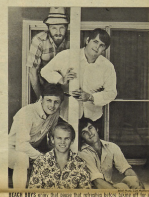
BEACH BOYS enjoy that pause that refreshes before taking off for a rather short four of England. It will be their first British hour and the Beach Boys will hit Finsbury Park Astoria, Totting Granada, Leiceste de Montfort, Leets Odeon, Manchester Odeon, Carofff Capitol and Birmingham Theattre. Other European stop-offs for the Beach Boys will be in France, Germany, Austria, Denmark, Newdein and Holland.