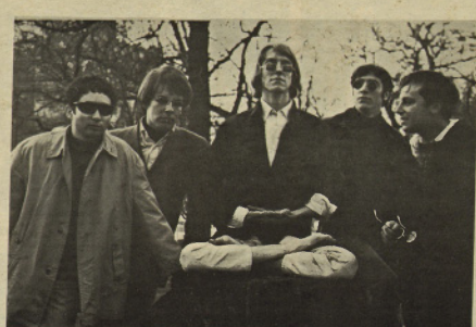
... first group signed to the newly formed Round Records.