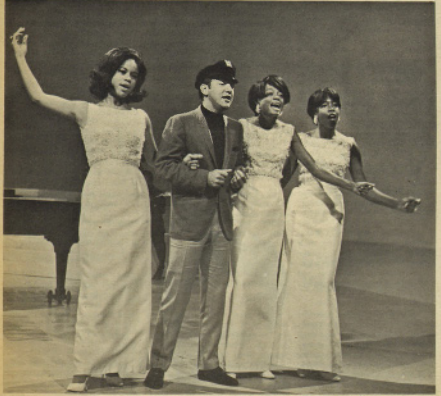
THE SUPREMES, attired in full length, sequined, multi-colored gowns are the stand-outs in the finale. The three beautiful Motown artists appear on the show in several different outfits - all absolutely gorgeous.