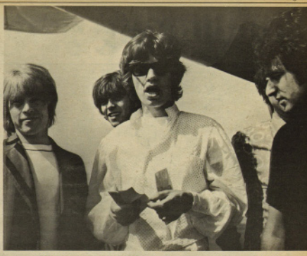
. . . BRIAN JONES AND MICK JAGGER are greeted at the airport by three of the Standells

"But you've got to be careful with follow-ups now. You can't get away with similar follow-ups in this country any more. We can't do another 'Winchester Cathedral' but we've got to do something with the same recognizable sound that people can identify."