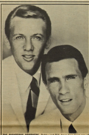
THE RIGHTEOUS BROTHERS, Bobby and Bill, have long been one of the most popular duos in the recording business. Starting out in the teen market, if didn't take them long to graduate to the top clusts in the nation. But now they're going one step further and will make a most of MGM! It's a one picture deal but if if goes over well there's a very good chance that the popular "Brothers" will make even more.