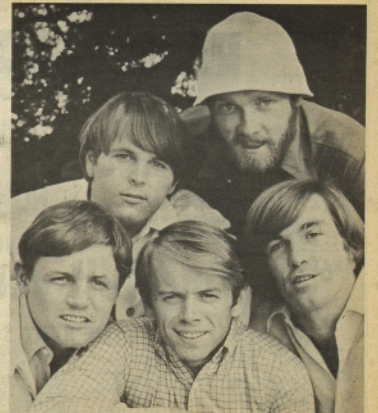
THE BEACH BOYS are the stars of a 24 minute color film entitled "The Beach Boys In London." The film, which as yet is only scheduled for British release, spotlights the singers during their November English tour with clips of both interviews and perferenances. It is being released by Immediate Music, the company which publishes Beach Boys' compositions in England.