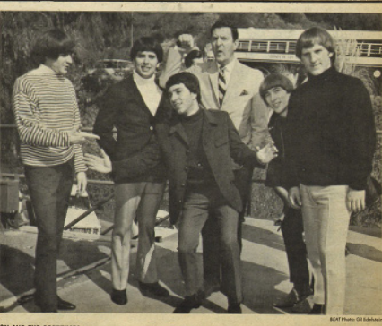
BON AND THE GOODTIMES, newest regulars on "Where The Action is," thoroughly confused David Kelchum, Agent 13 on "Set Smart," during an off-camera visit. Ketchum may have been asking which of the other "Action" regulars will soon depart the skow, since it's inconcrivable that all these groups can sandwich into the half-how program. Other regulars on the above are Table Review and Endievrs and the Action and Section 15 inconcrivable that all those groups can sandwich into the half-how program. Other regulars on the above are