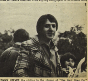
SONNY LEAVES the station to the strains of