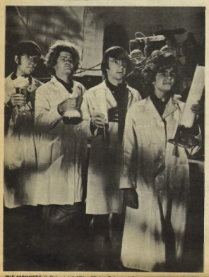
THE MONKEES (left to night) Main, Micky, Peter and Dayy too'r o'three week histos from their television show to play a cross-country toor which grossed $159,753 in four gigs. Davy paid a visit to England, where "The Monkees" is now being aired over the BBC, and commented that the Petrito chospus may only the slow slightly because "The been using a lot of things which don't mean asything in America but creatishly do in England."