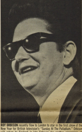
ROY ORBISON recently flew to London to star in the first show of the New Year for British televisions "Sunday At The Palladium." Orbison will return to England in late February for another appearance on "Palladium" and will remain in England for a five-week series of personal appearances. Detween his "Palladium" dates, Roy will venture to Australia and New Zealand.