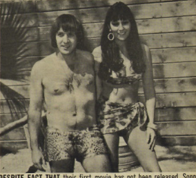
DESPITE FACT THAT their first movie has not been released, Sonny and Cher have already been signed for their second movie.

selves smack in the middle of a new controversy a couple of weeks ago when the city council of Monterey Park, California voted to re-