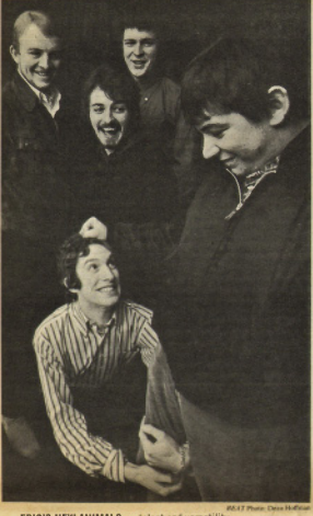
FRIC'S NEW ANIMALS - talent and versatility