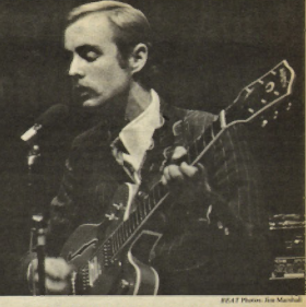
HARPERS BIZARRE - Still unbelieving about success

"We don't have top billing on these tours," says Scap, "but someday we'll headline.