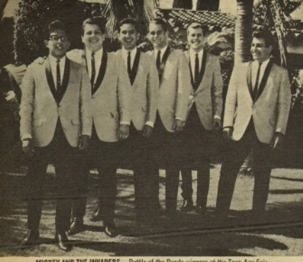
MICKEY AND THE INVADERS - Battle of the Bands winners at the Teen-Age Fair.