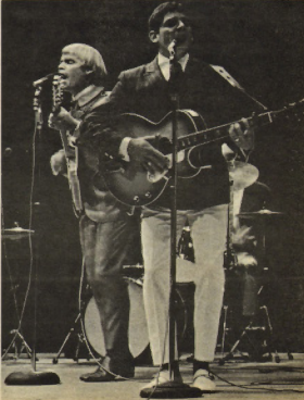
59TH ST. BRIDGE - First on their sightseeing list.