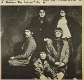
THE ROLLING STONES are set to tour Europe and England.

tween The Buttons." The album Stones, now number four album became the sixth consecutive in the nation's chairs—the other Stones' album to qualify for a God albums. being "Big His-High Record with sales numbering over Tide and Green Grass," "After the million mark. With the success" math" and "Foel Live IF you want