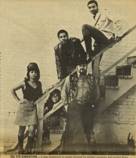
THE 5TH DIMENSION — a new dimension in sound inspired by modern harmony and soulful blues

'I saw 20,000 happy people there, just standing around liking each other," he said thoughtfully. cause his message (a musical com " And as his poem say: