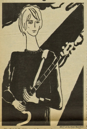
The first half of his panel discussion appeared in a previous issue of The Beat.