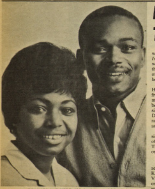
... PEACHES AND HERB: "We're just good friends.

the charts a week after its release Their first album, "Electric Comic Book," has just been released on