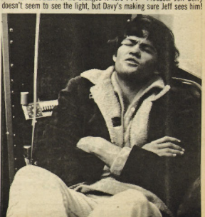
... THAT'S IT, guys, I'm through for this session."