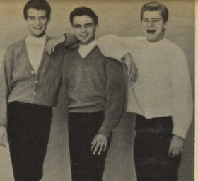
THE SANDPIPERS are set for San Remo Festival.

pleted a two month tour of the United States, began a whole new style of pop concerts by causing the overflow audiences to sit in silence and listen to what he was saving rather than jump up and down and scream and miss the whole point