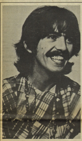
GEORGE HARRISON is the last Beatle to attempt a solo venture. He will write the entire score for an English movie, "Wonder Wall." The film will have its London premiere inthe late Spring or early Summer.