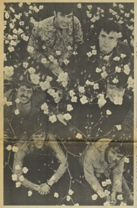
CONGRATULATIONS TO THE ASSOCIATION , . , the top pop group! See On The Beat for details.