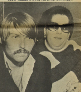
TERRY MELCHER shares a table with Cass & group with Beatles