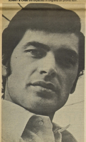
ENGLEBERT HUMPERDINCK continues to do well all over!