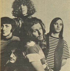
COUNTRY JOE AND THE FISH, one of the most popular groups to come out of the music scene in San Francisco. The new album, "Feel Like I'm Fixing to Die," is already rising on the charts.