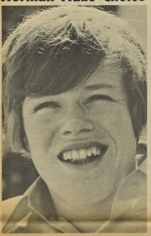
HERMAN set to play Pinocchio