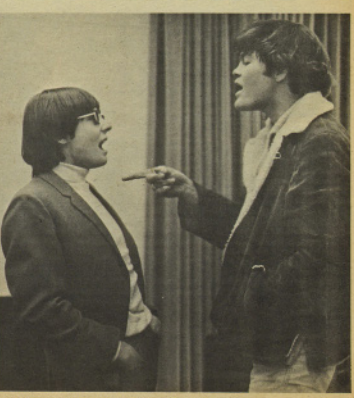
"WHAT DO YOU MEAN WE'RE OFF??" Yes, it's true, the Monkees appear to have had the knife comed own on their television show. At least, the official list of next season's shows has come out of NBC minus the Monkees. "Star Trek" is taking over the Monkees time slot . . . 7.30 p.m. on Monday.