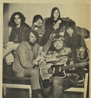
EVERYONE IS CURRENTLY TALKING about the so-called "Boston Sound" and the group which is the forerunner of the sound, the Ultimate Spinach. "We're not strictly interested in hilting the Top 40," admits the group, "but in just striving to further expand pop music. The Spinach is not necessarily a dance or a rock group, to fact we'd rather have people listen to the words of our songs and be turned on." So speaks the Ultimate Spinach.