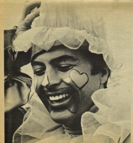
JAMES DARREN dons clown face for ABC-TV's "Romp" special.

Be sure to watch it, pull up the ratings and, hopefully, make the network see that youth specials do garner large audiences across the country