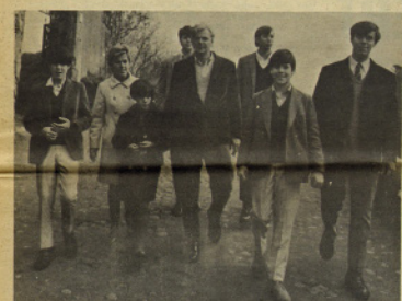
EIGHT OF THE COWSILLS take a stroll outside of Rome during their smash European tour. Meanwhile, they're not doing bedly Stateside with their current hit, "We Con