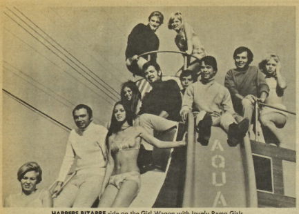
HARPERS BIZARRE ride on the Girl Wagon with lovely Ramp Girls.