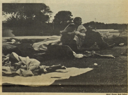
THERE WILL BE NONE OF THIS in 1968: Monterey will have no festival.

The civic groups charged that the last festival led to widespread marijuana smoking, violations of public morals and general disorders in open air sleeping accommodations by hitch-hiking groups on the fair grounds.