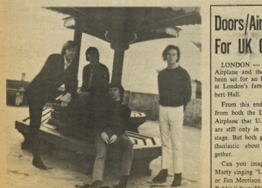
DOORS TAKE A rest before scheduled British tour

Can you imagine Grace & Marty singing "Light My Fire" or Jim Morrison doing "White Rabbit," Incredible