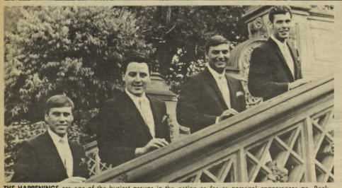
THE HAPPENINGS are one of the busiest groups in the nation as far as personal appearances go, Bookings set for the group include the "Merc Griffin Show" on March 6; Doylestown, Pa. (8); Holyoke, Mass. (9); and Chester, Pa. (13). He Happenings will play the posh Eden Roc in Mismif from April 1 Through 7.