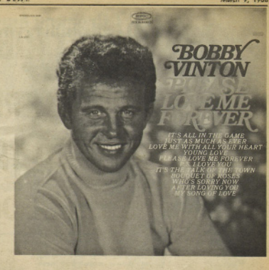
Now Available At: MONTGOMERY WARD DEPARTMENT STORES