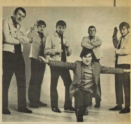
THE ALAN PRICE SET is heading across America on a five week tour in conjunction with a heavy promotional push on their new album, "The Price is Right." Cities set for the Price invasion are New York, Hollywood, Dallas, Phoenix, Tucson and Detroit.