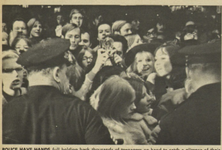
POLICE HAVE HANDS full holding back thousands of teenagers on hand to catch a glimpse of their favorite recording star during KRLA's live broadcast of the "How I Won the War" premiere in Beverly Hills.