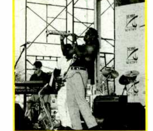
Everette Harp - Smooth & Saxv