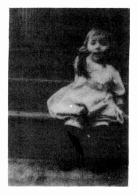
WHO IS IT?

He gives an account of each second of the day,