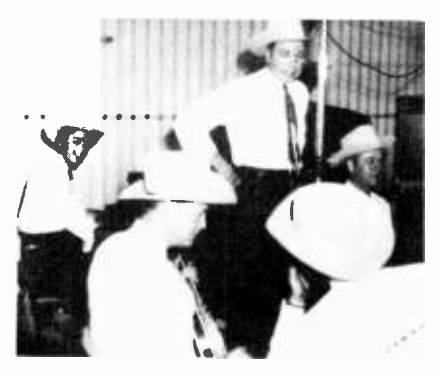
More of the Texas Playboys

The band filled our studio A to capacity—there wasn't space to have an unscheduled thought without disturbing the next man's thinking—and when the boys let go with their blast of music (as they do with so many instruments) the "joint was really