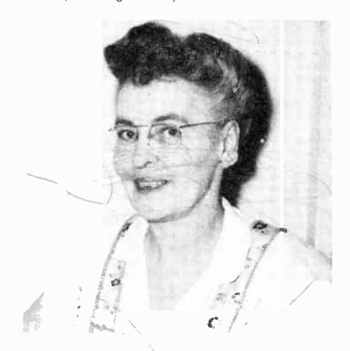
MRS. "KITCHEN TALKS"

Roll out a pound of sausage on waxed paper in a rectangle ½ inch thick. Combine 2 cups diced apples, 2 cups bread crumbs and I small onion (diced) and spread over meat. Roll like a jelly roll, place in baking dish, and bake in moderate oven (350 degrees F.) for about 45 minutes.