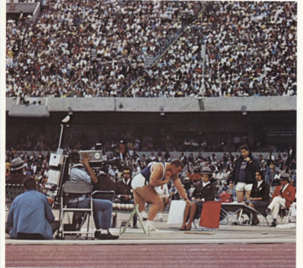
The network's extensive coverage of the Winter Olympics from Grenoble, and the Summer Olympics from Mexico City, a milestone in television history.