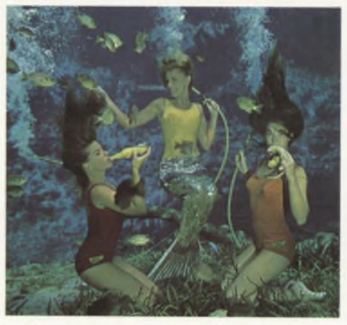
A performance by the "mermaids" of Weeki Wachee.

Above top: Dolphin show at the Oceana Theatre in Marine World. Above center: View of Silver Springs with its glass-bottom boats.