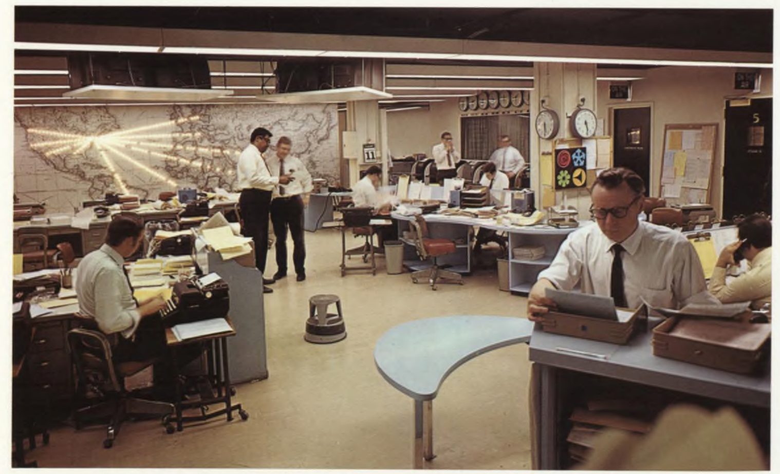
The major news center in New York for the network's four radio services.

The acquisition in July of KXYZ and KXYZ-FM in Houston brought the total number of owned radio stations to the legal limit of seven AM and seven FM stations. In entering the southwest, ABC is contributing to the growth of broadcasting in one of America's primary growth areas. By 1969, the population of metropolitan Houston was 1,778,000, making it the 13th largest market in the country. The move into Houston was particularly appropriate and desirable because the seven owned stations now are located across the nation in the dense and growing population centers of New York, Pittsburgh, Detroit, Chicago, San Francisco, Los Angeles and Houston. Following their acquisition, KXYZ and KXYZ-FM news operations were expanded. In the process, an ABC News Bureau was established in Austin, the State Capitol of Texas. Subsequently, the Houston stations were honored with the