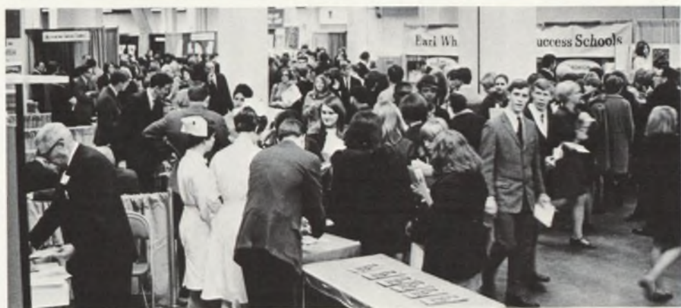
Annual Career Exposition created and sponsored by KQV in Pittsburgh.