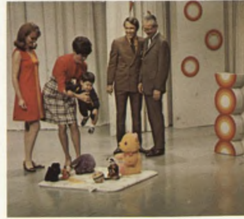
'The Anniversary Game," produced by the owned TV station group, is seen in its five markets and distributed by ABC Films.