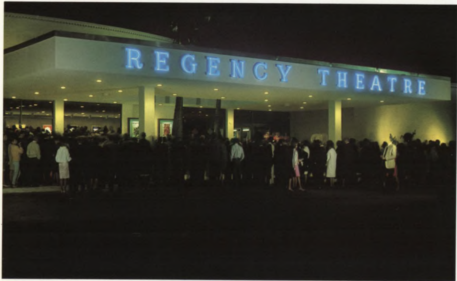
Regency Theatre in Jacksonville, Florida, one of twelve new theatres which opened in 1968.