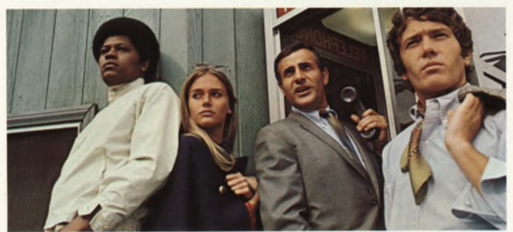
"The Mod Squad," one of this season's most innovative and talked-about new programs.

As a result of the changed emotional climate in the nation regarding the portrayal of incidents of violence on television, the network directed a complete re-examination of all television programming. The network has always had a firm policy of "prohibiting the use of violence for the sake of violence" on its television entertainment schedule. Specific orders to those responsible for programming reiterated this policy and