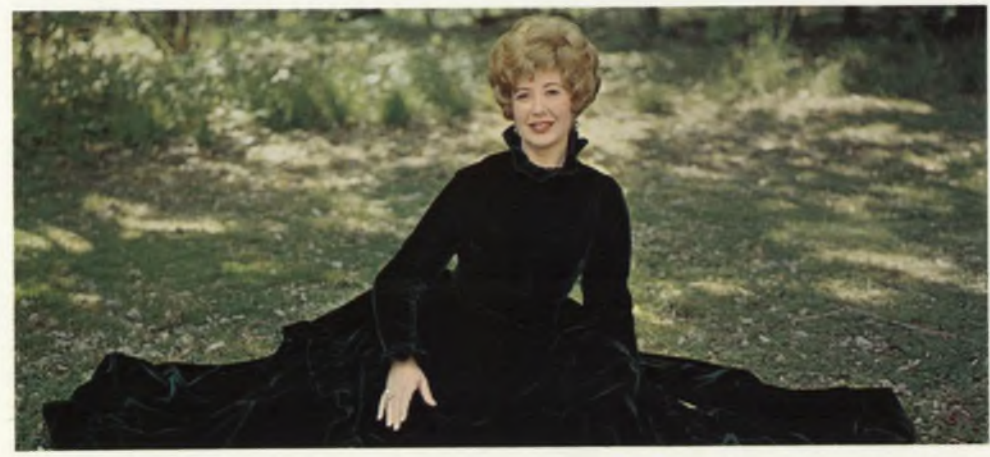
Beverly Sills, internationally famous soprano, recording on Westminster Records.