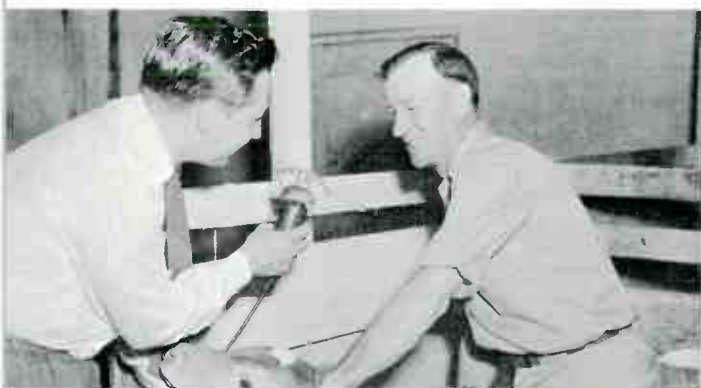
MEMBERS OF THE WLW FARM DEPARTMENT STAFF travel more than 100,000 miles a year visiting farms and attending farm meetings in Ohio, Indiana, Kentucky and the surrounding area, plus attending conventions, clinics and conferences across the nation.