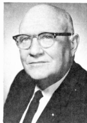
MAYOR W. PAUL WOODS, City of Canton