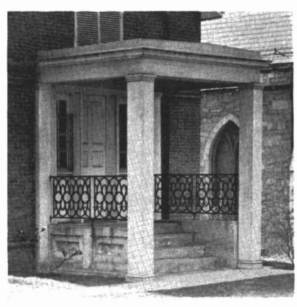
Doorway of WCAO's Control Room.

While close to the exact center of the city's population, WCAO is free from town-made interference.