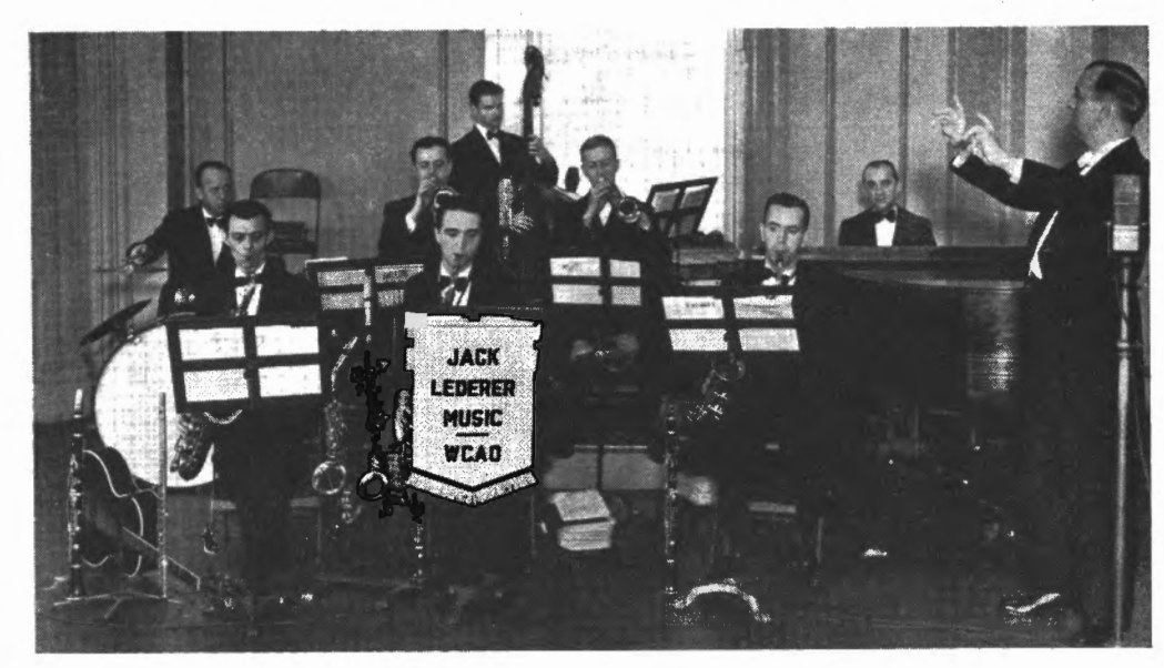
Studio No. 1 is large enough to accommodate a military band, but is more often used by orchestras and choruses.

The station has the most modern facilities for the making of high class electrical transcriptions, which are frequently useful in the presentation of commercial announcements, and sometimes for whole programs. These afford a measure of economy that keeps the sponsorship cost at a minimum.