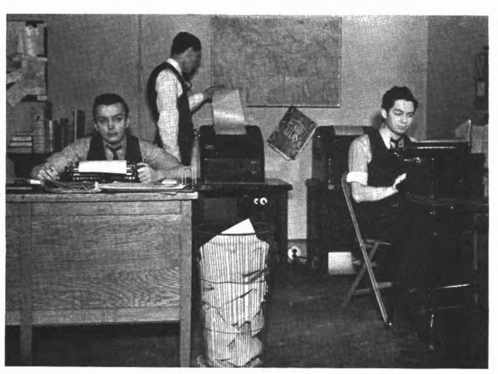
Telegraph wires leading into the News Bureau daily bring in more than 80,000 words of news from all parts of the world.

THE station's Music Library is an extensive one, and includes a collection of many hundreds of electrical transcriptions. They cover music of the past and present, and it would be difficult to suggest a selection that could not be instantly produced from this large array of melodic recordings.