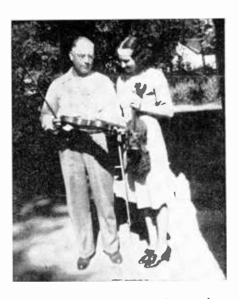
The Colonel and Maureen discuss the merits of Colonel's rare old fiddle.