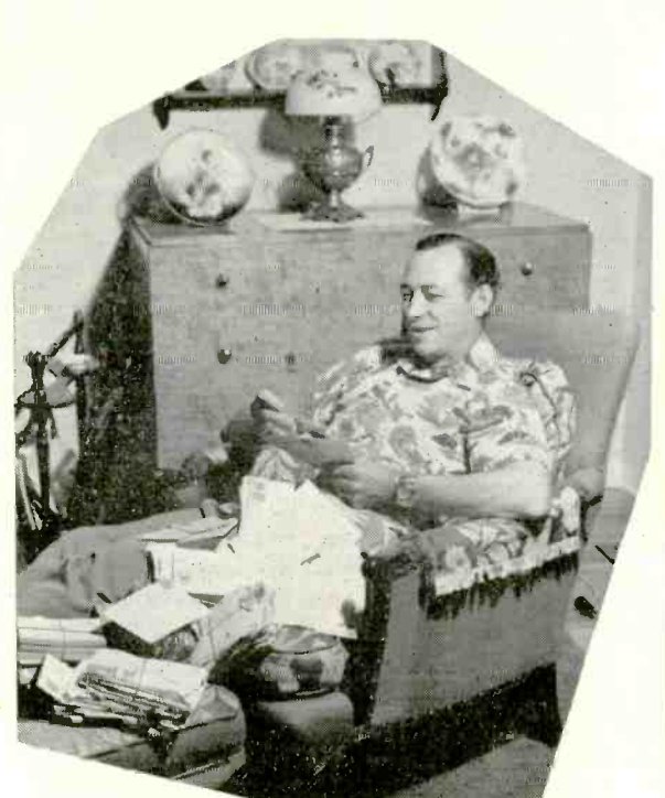
Eddie's fan mail comes from all parts of the world and he makes it a point to read everyone of the thousands of letters personally.