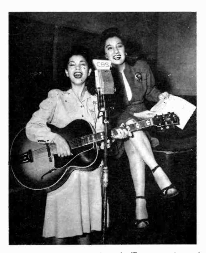
Much time is spent in rehearsal. They memorize each arrangement.