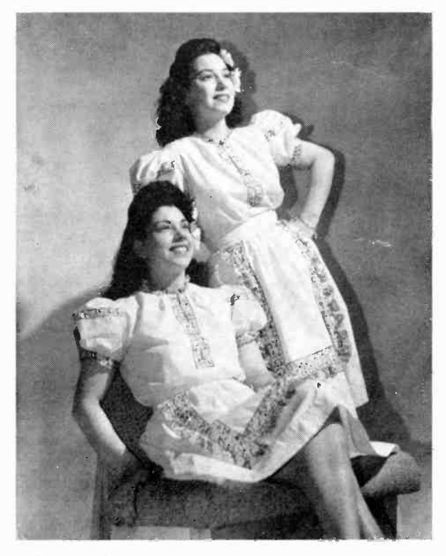
Off the air the girls like to relax in colorful costumes. Can wear almost any color.

It's really a pleasure to work with the girls. They are as charming off the air as they sound while on the air. We are proud to have them in the big W2BW Family.