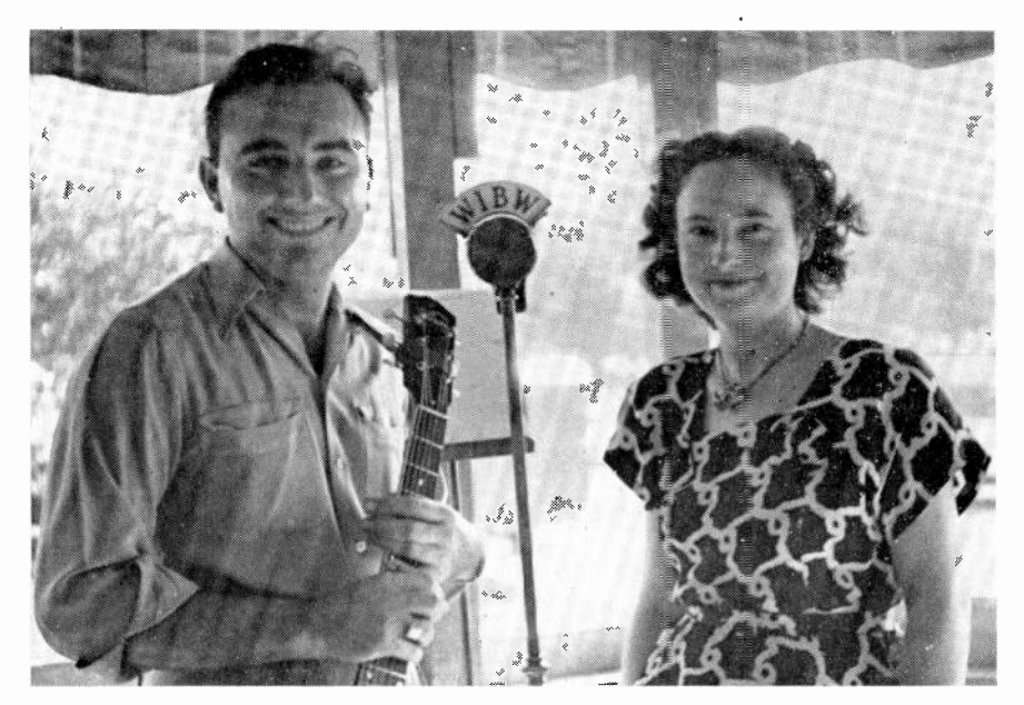
Here are two of WIBW's busiest entertainers. Doc and Esther now have three duet shows per day, 6:45, 8:15, 10:30. The first two programs are comprised of all hymns.

"Positive" means being mistaken at the top of one's voice.