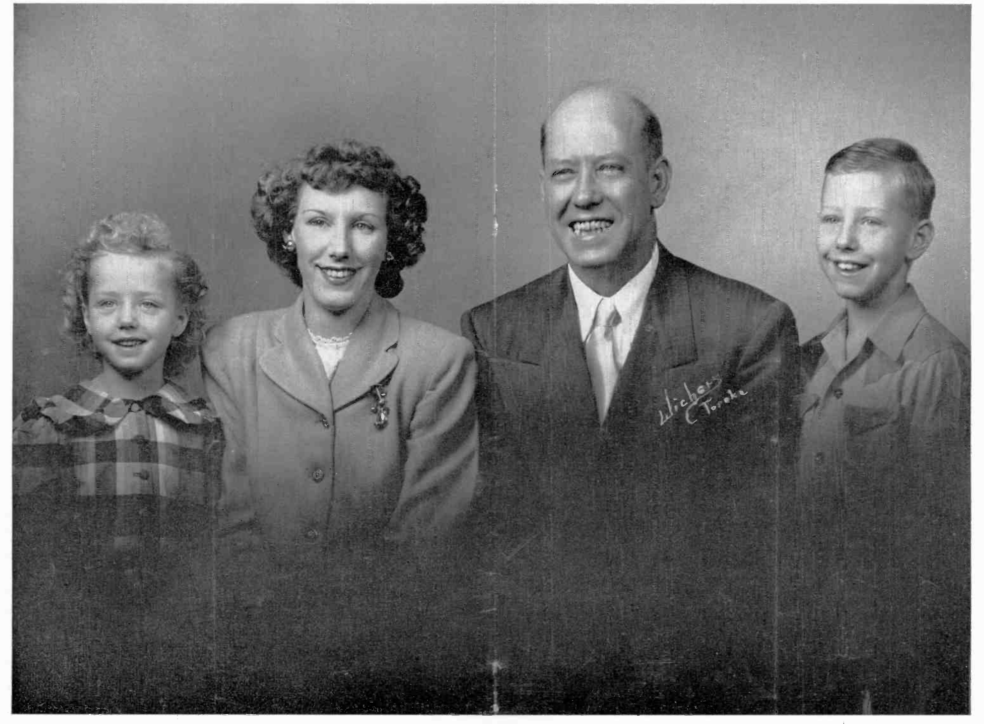
THE LIVGREN FAMILY