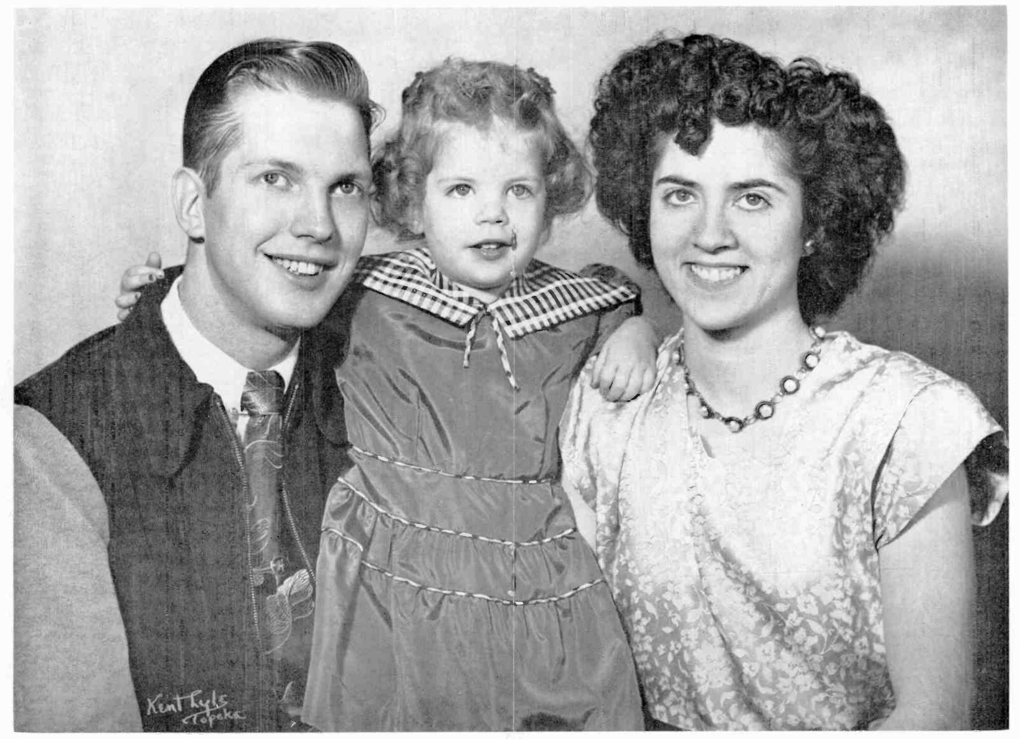
THE HARRIES FAMILY