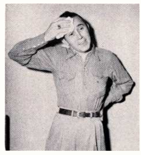
Sugarfoot wipes his brow as he recalls his "embarrassing moments."

Realizing the humor behind most of Life's Embarrassing Moments, I plan to write a series of articles about the embarrassing moments suffered by various members of the WIBW staff. Some of them are "Lulus"-believe you me!