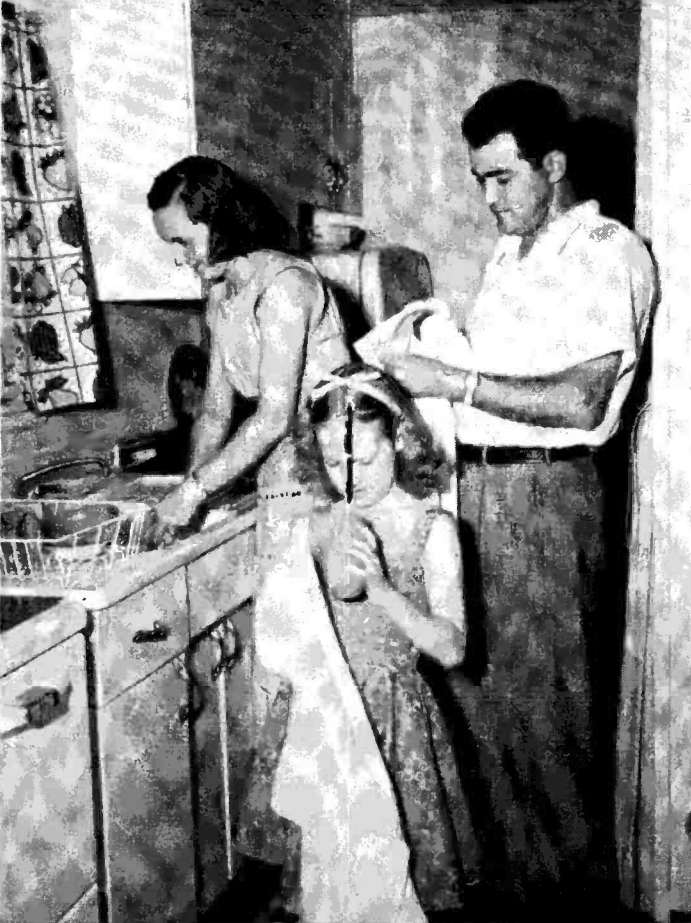
At 1808 Green Acres

(Below) All three Laymans enjoy watching television.