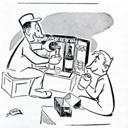
"Pretty part of it is, the darn thing folds up to look just like a ianch-box !'