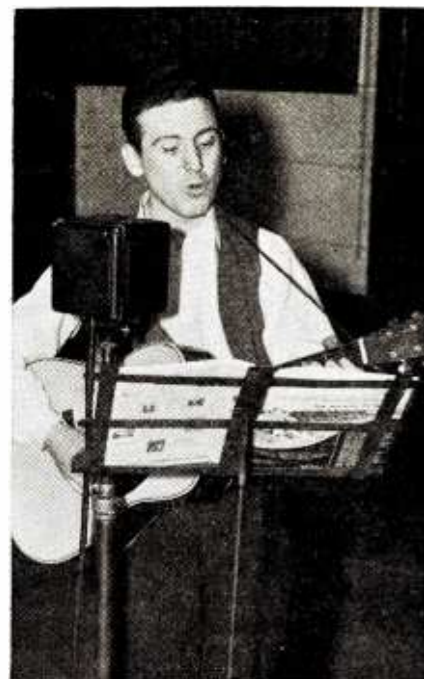
"Down on the Old Plantation" is a fine place to be, according to Ramblin' Red Foley, pictured here "on the air."