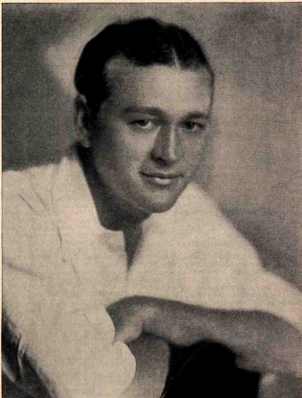
FORD RUSH - Page 9