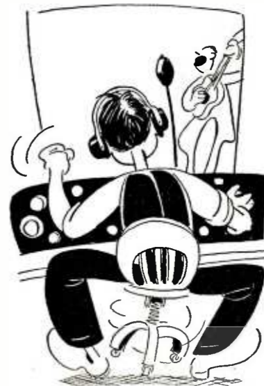
"Oh, well, it's a living anyhow."

One minute to go now. The signal to "stand-by" is given. The cast is ready at the microphone. Sound technician is poised. Orchestra leader waiting for his cue, his baton raised. Every eye is on the director's face. He raises his hand. Gives the "go ahead"—starts his stop-watch, and another drama is launched upon the ether waves when—the clock on the studio wall reads . . . two-thirty.