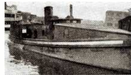
A view of the Dad Ludwig.