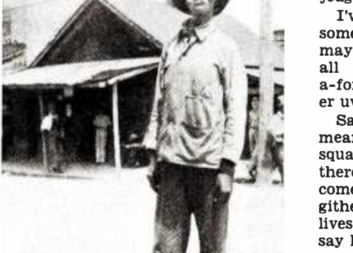
"Dey was a rumblin' in de yearth!"