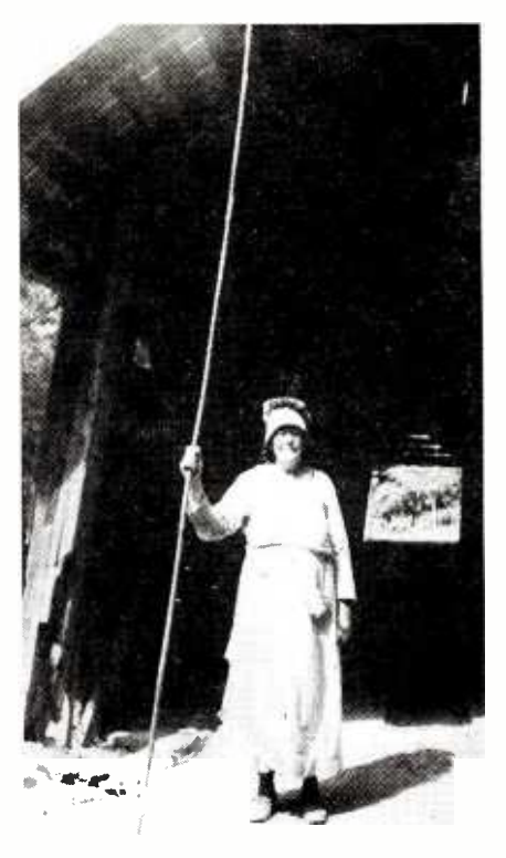
A Winston county, Alabama, angler pauses at the entrance of an oldfashioned covered bridge.

Well. I see that they've got a new fad out, an' this'n didn't start in Hollywood either. It's Cabinet changing. England changed theirs in ten minutes the other day, they must have 'em streamed-lined fer speed. Now France tuck a little longer on theirs, they changed Cabinet members six times in one week. By the time they got a new set uv members in, an' I learned to pronounce their