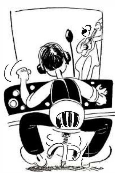
"Come on, fellow-sharpen it up."