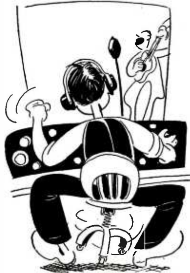
"Sounds like mutiny on the high 'C's.'"

Embarking July 5 for Hollywood to work in pictures with Lily Pons, Andre Kostelanetz believed he was to have at least a brief respite from radio. He had no sooner arrived at the Los Angeles airport than he was pressed into duty as guest conductor for the "Hollywood Musical Mirror" program of July 21. The "Musical Mirror" orchestra is composed of musicians from the picture studios.