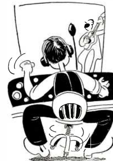
"He should throw away his pick and get a pick-axe."

Home: be it ever so humble, it's no place to grumble.