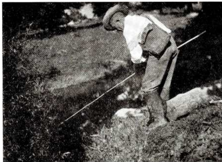
The Latch String proprietor investigates the sunfish situation.