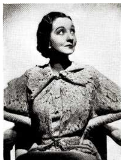
A nervous Manhattan tailor caught her spirit.