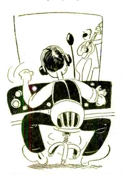
"Wonder if he ever considered sword-swallowing as a career."

Oscar Tengblad once went on the road with an animal show. He expected to play in the band, but ended up by acting as groom to the beasts instead.