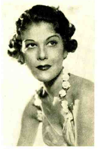
She wants her gowns dramatic.

Clinching her statement with actual proof, the young actress has ac-