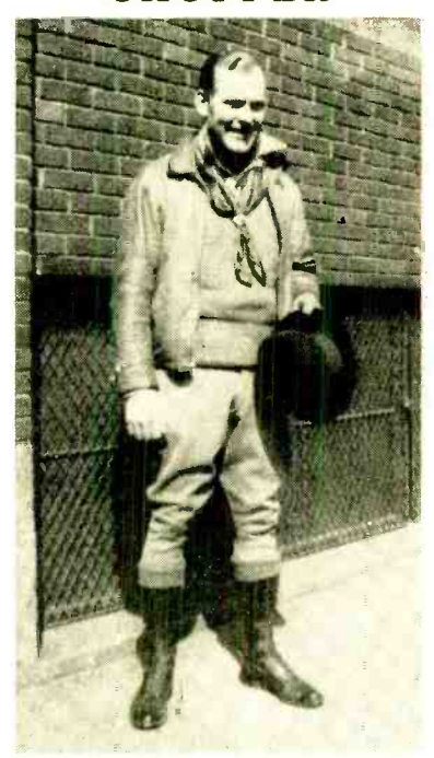
THE ARKANSAS WOODCHOP-PER was all set to leave on a road tour but he stopped to pose for Frances O'Donnell's camera.