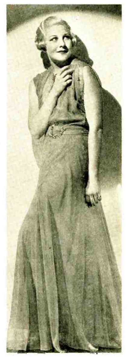
It's a grand gown for duncing.

When I go to a supper club after the theatre, I sometimes wear the delph blue chiffon evening gown pictured here. Because of the full skirt rustling over a taffeta slip, it's grand for dancing. The wire belt