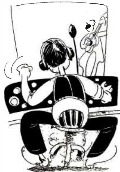
"I certainly feel down in the mouth this morning."