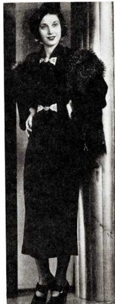
No overalls for her.

The costume I'm wearing in the accompanying picture is a comfortable all-occasion outfit. The dress is made of black embroidered crepe, trimmed with a butterfly buckle at the waist, matching the clasp at the neck. They are of gold and turquoise