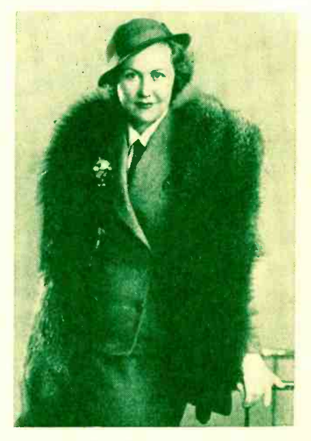
Tailored for the street.

TAILORED clothes always have been my favorite for street wear, so I'm glad when mannish suits are fashionable as they are these days. I went to an advance showing of woolen suits by Creed of Paris the other day, and this amazing French couturiere even carried the