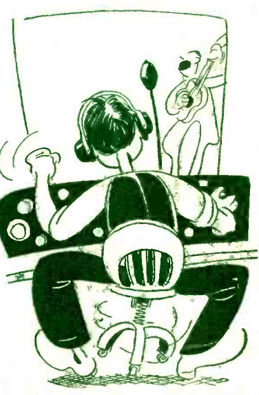
"If I were Santa Claus I know what I'd bring that guy."