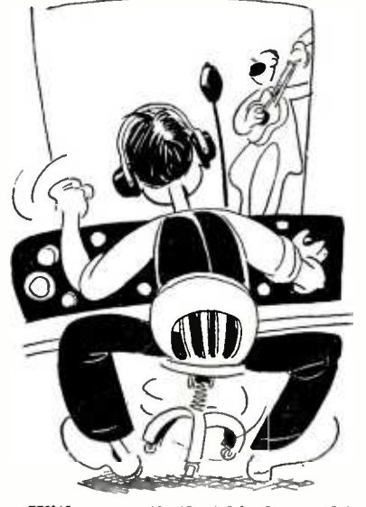
With a mouth that big he ought to sing a duet . . .

BOUT five months ago you could have seen an Arizona cowpuncher leanin' against a corral fence studyin' with considerable interest a yellow piece of paper.