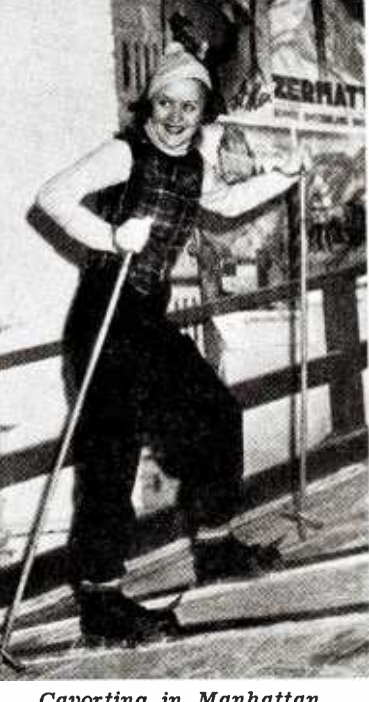
Cavorting in Manhattan

FOU wouldn't expect the city of skyscrapers to offer much in the way of ski-jumps, would you? But if there is any little thing New York doesn't have, the enterprising merchants usually get around to acquiring it sooner or later. This year ski-jumps have been popping up in department stores all over town-