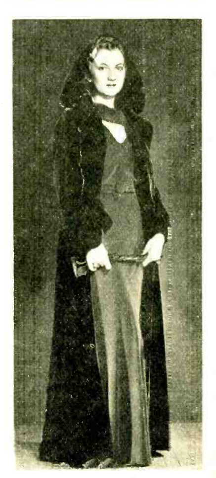
No cabbage patch gown.

Besides being fashionable, the hood arrangement is really very practical. Now that we are in the midst of real wintry weather it's a comfort to have