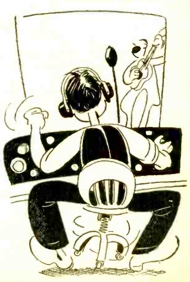
"Silence may be golden, but that guy can't buy a postage stamp."